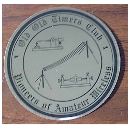
3" Dia. Decal, sticky back (page 3)

A DVD containing copies of all member applications, the "Blue Book", all issues of Spark-Gap Times, available to members only. Send $10 to 3191 Darvany Dr. Dallas TX 75220-1611