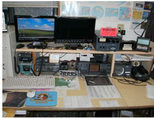
CHUCK WILLIAMS STATION, KI7DG, #4509(PAGE 6)