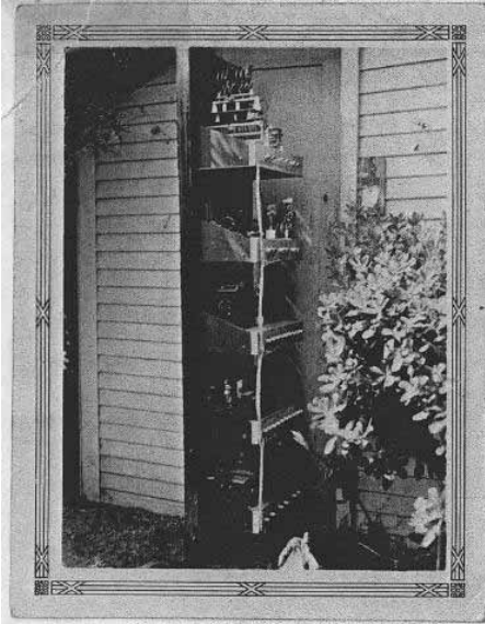
Rig I built in 1941 At age 17.