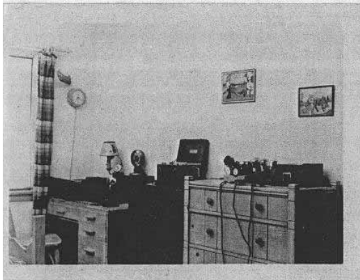
1939 Ham Station WE Carbon Mike Code practice Tape Machine 5-Meter Transmitter